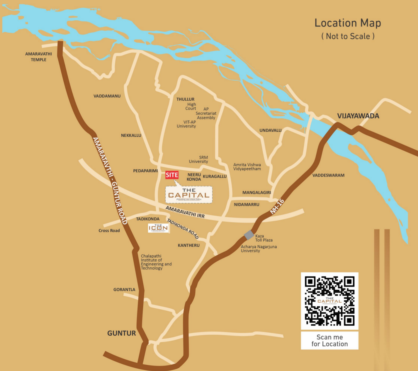
Location Map ( Not to Scale )

Embrace an unparalleled lifestyle at THE CAPITAL, our exquisite collection of premium villa plots in Pedaparimi, Amaravati. Nestled amidst serene environs and boasting of excellent connectivity, our plots offer the perfect canvas for you to build your dream villa. Indulge in spacious living, surrounded by nature's bounty, yet close to all the modern conveniences that Amaravati, the burgeoning capital city of Andhra Pradesh, has to offer.